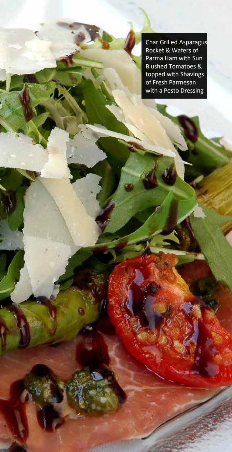
Char Grilled Asparagus Rocket & Wafers of Parma Ham with Sun Blushed Tomatoes & topped with Shavings of Fresh Parmesan with a Pesto Dressing